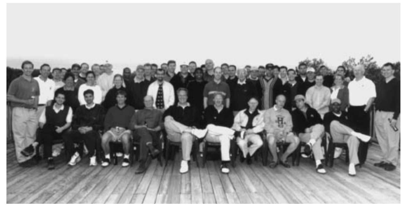
Participants of the 3<sup>rd</sup> annual Harvard Orthopaedics golf outing.