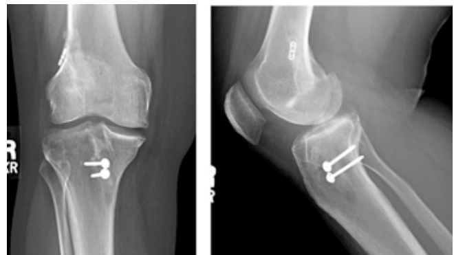
Fig. 3. AP and lateral radiographs 3 months after right knee revision ACL reconstruction using screw fixation of the graft within the tibial tunnel. Washers can be used in order to increase the surface area for compression across the graft, as demonstrated in these radiographs.

The outcomes of revision ACL reconstruction are not as favorable as primary ACL reconstruction, and thus patients should be counseled regarding realistic expectations after revision [11]. Results of a prospective case-control study of 49 patients undergoing two-stage ACL revision with bone grafting of the tibial tunnel found that this revision technique can achieve laxity measurements similar to those after primary ACL