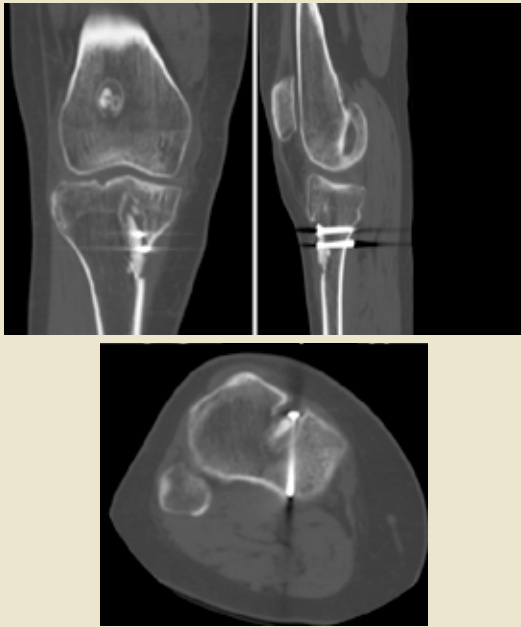
Fig. 2. Coronal, sagittal, and axial CT images 7 months after right knee revision ACL reconstruction using screw fixation of the graft within the tibial tunnel.

described previously. Following this, the knee was stable and had full range of motion with negative Lachman and pivot shift tests. Radiographs and CT images at 7 months postoperatively are shown in Figures 1 and 2, respectively.